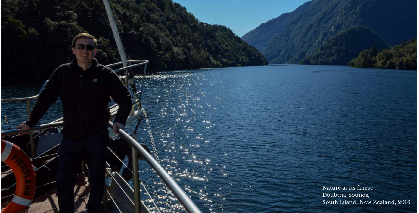
Nature at its finest: Doubtful Sounds, South Island, New Zealand, 2016